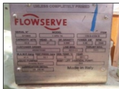
Figure 8: Manufacturer Pump Information